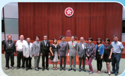
Invited Members of the International Chinese Tourist Association to the LegCo Guest Day Lunch