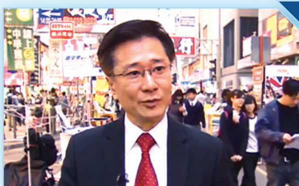
Attended an Interview by the RTHK at "LegCo Review"