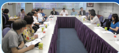
At the Symposium on the Establishment of TIA, hosted by the Hong Kong Association of China Travel Organizers