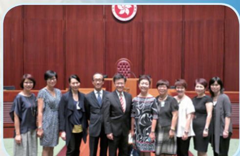
With Fellow Colleagues and Friends at the LegCo Chamber