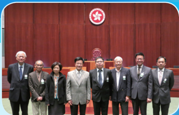
With Representatives of the Tourism Industry at the LegCo Chamber