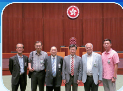
Invited Members of the Society of IATA Passenger Agents to the LegCo Guest Day Lunch