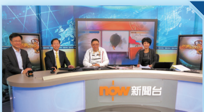
At an Interview by the Now News at "New Magazine" on Issues Related to Travel Insurance