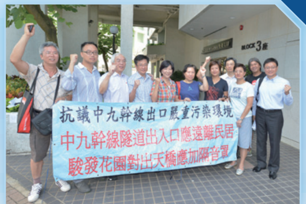
As the LegCo member on duty, carried out a site-visit at the Central Kowloon Route and Gascoigne Road Bridge and examined the air and noise pollution problems in Yau Ma Tei.