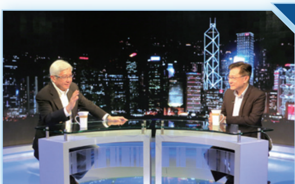
Attended an Interview by the Phoenix Hong Kong Channel at "News Deconstructor"