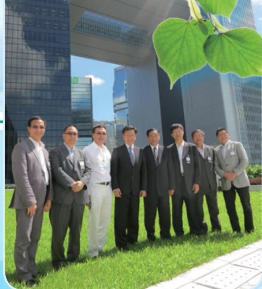
Invited Members of the Hong Kong Outbound Tour Operators' Association to the LegCo Guest Day Lunch