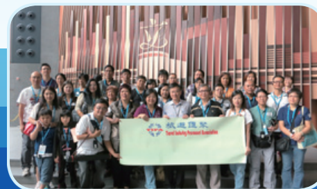
Visited LegCo with Members of the Travel Industry Personnel Association