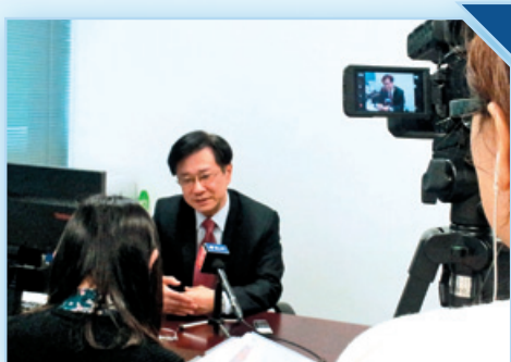
At an Interview by the China News on Issues Related to the Monitoring of Tourist Industry