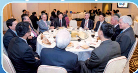
Attended the 34th Annual General Meeting cum 18th Governors' Election of the Hong Kong Taiwan Tourist Operators Association