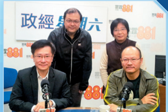
Attended "Saturday Forum" at Commercial Radio