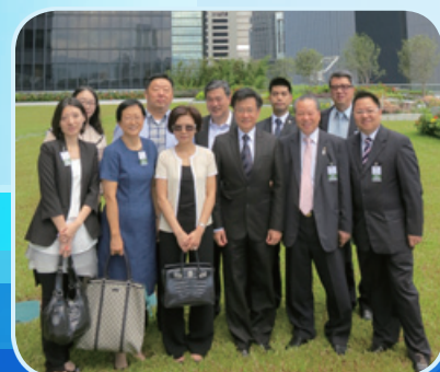
Invited Members of the Hong Kong Japanese Tour Operators Association to the LegCo Guest Day Lunch