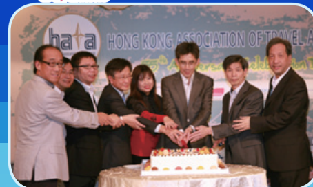
Attended the 55th Anniversary Dinner of The Hong Kong Association of Travel Agents