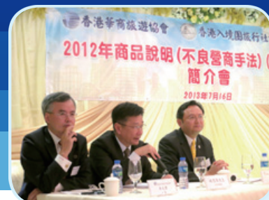
Worked with Fellow Members in Organizing the Briefing on "Trade Descriptions (Unfair Trade Practices) (Amendment) Ordinance 2012"