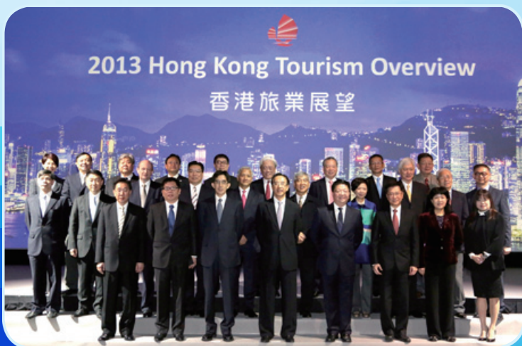
Attended the "2013 Hong Kong Tourism Overview" Organized by the Hong Kong Tourism Board