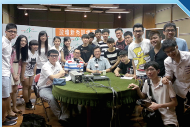
Attended the "Young Politian" organized by RTHK