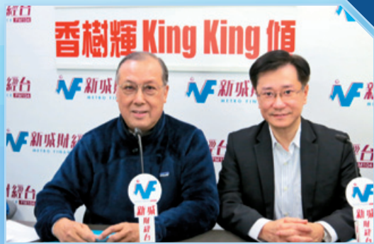
Attended "Breakfast with Heung Shu Fai" at Metro Radio