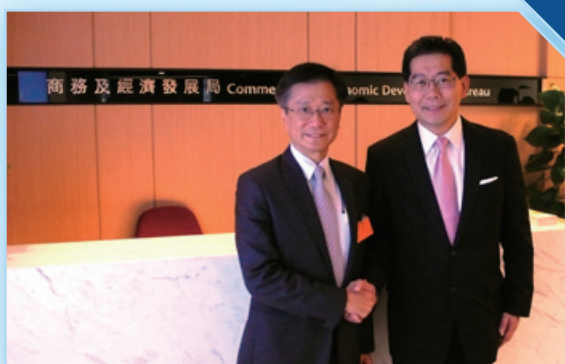
Meeting with The Hon Gregory SO Kam-leung, Secretary for Commerce and Economic Development