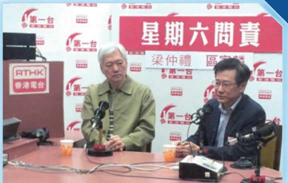
Appeared in "Saturday Accountability" at RTHK