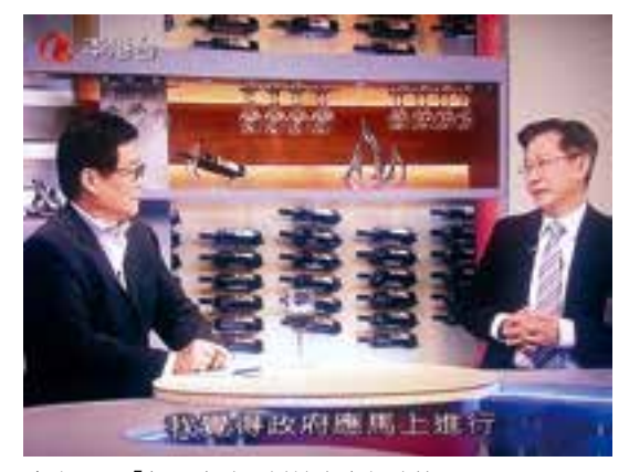
出席 ATV「把酒當歌」討論自由行政策 (2014/5/6) Appeared in "News Bar Talk", a programme of ATV, to discuss the Policy of Individual Visit Scheme (2014/5/6)

Appeared in "LegCo Live room" at TVB to discuss the Black Travel Alert in Bangkok and Hong Kong's tourist reception capacity (2014/1/22)