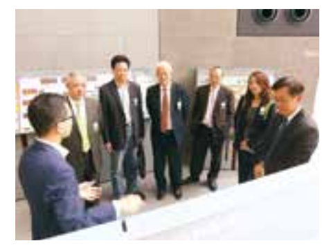
邀請港台旅行社同業商會理事會成員參觀立法 會 (2013/10/25)

Exchange ideas with Travel Industry Personnel Association regarding the launching of the National Tourism Act and its impacts on practitioners in the tourism industry (2013/10/19)