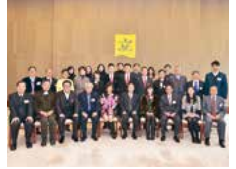
與東華三院、保良局、九龍樂善堂、博愛醫院、 仁濟醫院、仁愛堂六個慈善團體會面。圖為與 東華三院董事局成員合影 (2014/1/20)

Met with representatives of six charity organizations, namely Tung Wah Group of Hospitals, Po Leung Kuk, The Lok Sin Tong Benevolent Society Kowloon, Pok Oi Hospital, Yan Chai Hospital, and Yan Oi Tong. Above is a group photo with the Tung Wah Board of Directors (2014/1/20)