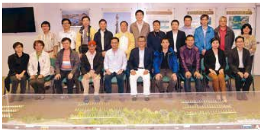
2014 年 5 月 10 日,與發展局及大嶼山諮詢委員會成員參加考察。 Joined a study tour with the representatives of the Development Bureau and members of the "Lantau development Advisory Committee" on May 10, 2014.

I submitted Policy Recommendations for the 2014 Policy Address to Chief Executive and requested the Government to formulate timetable for the Lantau Development Plan as soon as possible. My suggestion of using the Hong Kong-Zhuhai-Macao Bridge as the steering element to turn Lantau into a tourist island was well-accepted, and the Government decided to set up a "Lantau development Advisory Committee". Led by the Secretary for Development, the Committee suggested coordinating and planning the construction of various facilities based on the existing tourist resources in Lantau. I am much honoured to be appointed as a member of the "Lantau development Advisory Committee" and to be able to participate in matters relating to the future development of Lantau.