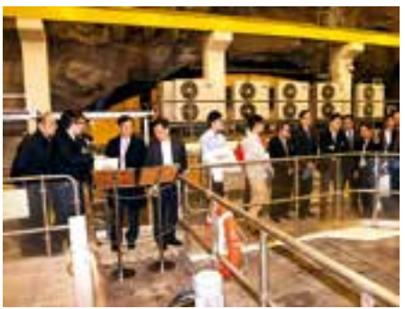
參觀設於岩洞內的赤柱污水廠 (2014/2/18) Visited the Stanley Sewage Treatment Plant located in caverns (2014/2/18)

Met with the Deputy Chairmen and Chairmen of the 18 District Councils as well as District Council Members of the Kwun Tong, Sham Shui Po, Islands, Eastern, and Kowloon City districts so as to understand the pressing concerns in various areas that requires immediate solutions. Above is a group photo with members of the Islands District Council (2014/5/8)