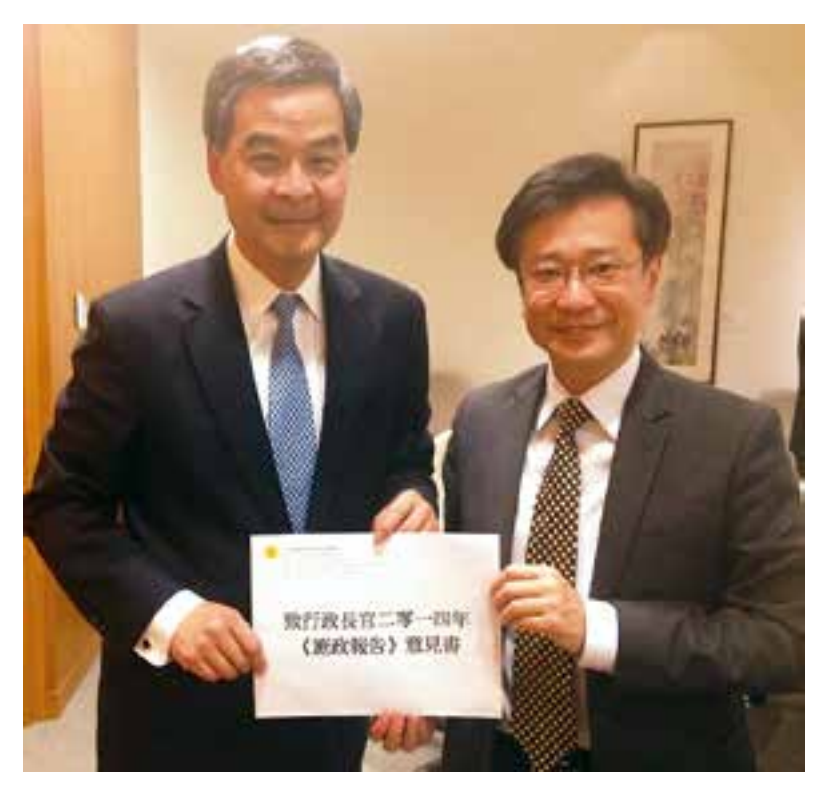
2013 年 10 月 31 日,我向行政長官梁振英遞交施政報告 意見書,要求做好香港整體旅遊規劃工作。 On October 31, 2013, I submitted Policy Recommendations to Chief Executive Mr Leung Chun-ying, requesting the Government to have an overall plan for the development of tourism in Hong Kong.