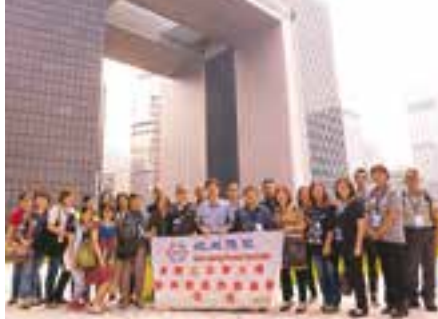
與旅遊匯聚交流國家旅遊法的實施對從業員的 影響 (2013/10/19)

Exchange ideas with Travel Industry Personnel Association regarding the launching of the National Tourism Act and its impacts on practitioners in the tourism industry (2013/10/19)