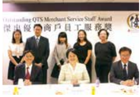
出任優質旅遊服務計劃 (QTS)「傑出優質商戶 員工服務獎」評委 (2013/9/12)

Attended the "SMEs and ITs Business Matching for Travel Industry" organized by the Office of the Government Chief Information Officer, which aimed at encouraging small and medium-sized travel agencies to use more external resources for selfenhancement (2014/6/20)