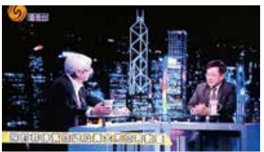
出席鳳凰衞視香港台「時事大破解」討論菲律賓旅遊及 五一黃金周人數 (2014/5/1)

Appeared in "News Magazine" at NOW and discussed the ways to properly deal with tourist complaints (2013/12/24)