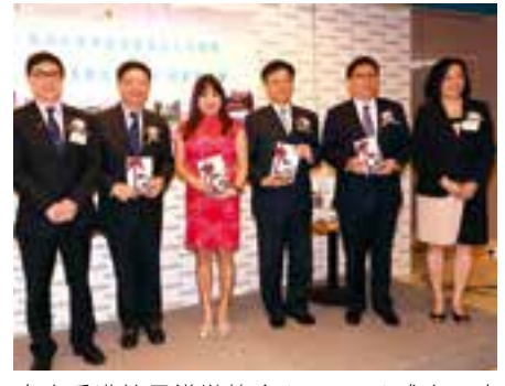
出席香港註冊導遊協會(HARTCO)成立三十 周年暨《香港景觀文化導遊》新書發佈會 (2014/5/28)

Served as a member of the judging panel for final competition of the "Best of the Best Culinary Award", organized by the Hong Kong Tourism Board (2014/8/13)