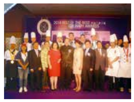
出任香港旅遊發展局「2014 美食之最大賞」 決賽評判 (2014/8/13)

Served as a member of the judging panel for the "Outstanding QTS Merchant Service Staff Award", organized by the Quality Tourism Services Scheme (QTS) (2013/9/12)